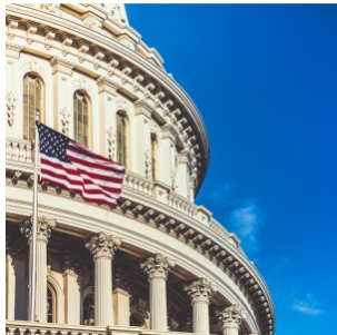
The $2 trillion emergency relief package represents a bipartisan effort intended to assist individuals and businesses during the ongoing coronavirus pandemic and accompanying economic crisis.